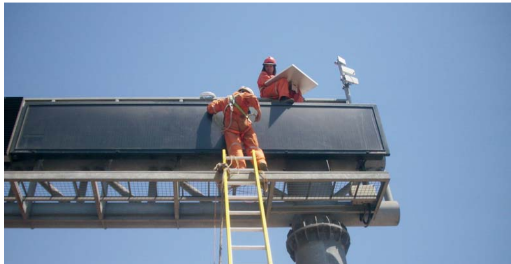
RADWIN’s solutions installed on billboard signs along Chile’s A-16 highway